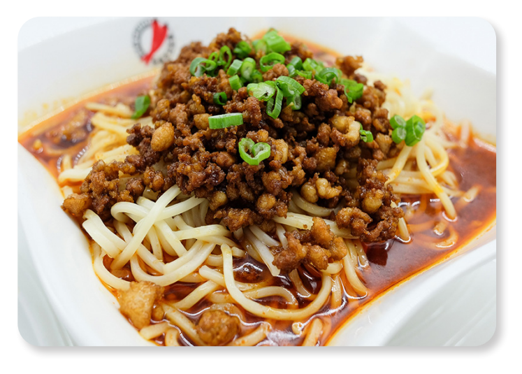
Sichuan DanDan Noodles with Minced Pork & Chilli Sauce in Soup 四川担担面 £10.50