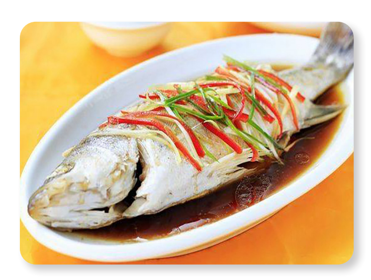
Steamed Seabass with Soy Sauce 清蒸鲈鱼 £19.00