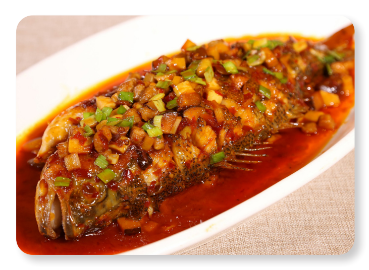
Pan Fried Seabass with Minced Mushroom, Bamboo Shoot & Pork 干烧鲈鱼 £19.00