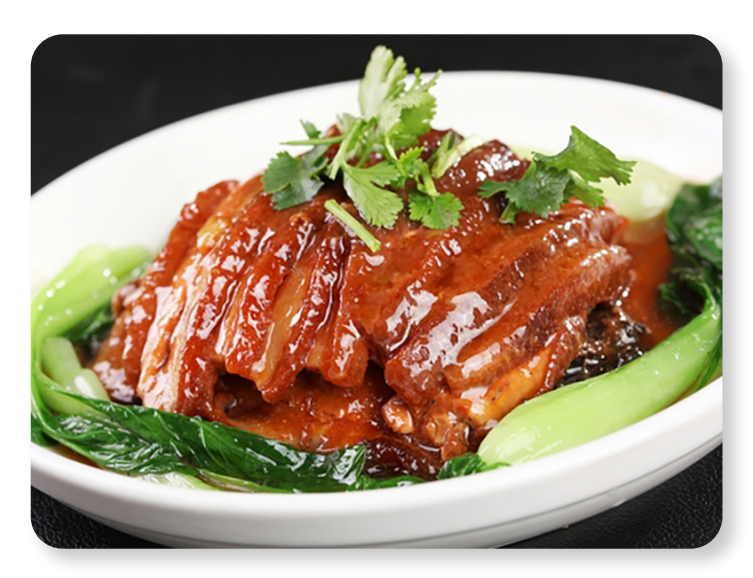
Braised Sliced Pork Belly with Preserved Cabbage 冬菜扣肉 £11.50