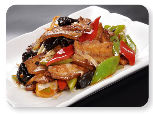
Sautéed Sliced Pork Belly with Chilli 山城回锅肉 £11.50