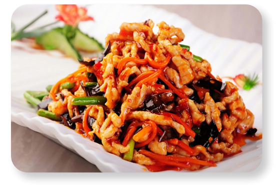
Sautéed Shredded Pork with Black Fungus in Sweet & Spicy Garlic Sauce 鱼香肉丝 £11.50

Crispy Pork with Sweet Sauce锅包肉£11.50Braised Pig Feet in Hot Spicy Sauce (With Bones)香辣猪手£11.50Braised Pig's Joint红烧元蹄£12.50Spicy Pig Intestines辣子圈圈肠£11.50Deep Fried Pig's Joint with Spicy Sauce麻辣烤猪肘£13.50