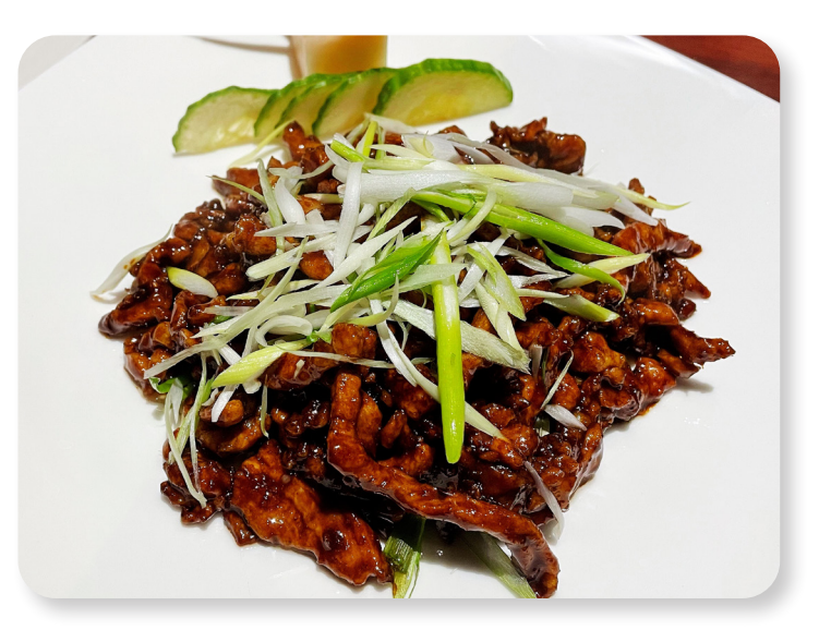
Sautéed Shredded Pork in Hoisin Sauce (Served with Steamed Pancakes) 京酱肉丝 £11.50

Crispy Pork with Sweet Sauce锅包肉£11.50Braised Pig Feet in Hot Spicy Sauce (With Bones)香辣猪手£11.50Braised Pig's Joint红烧元蹄£12.50Spicy Pig Intestines辣子圈圈肠£11.50Deep Fried Pig's Joint with Spicy Sauce麻辣烤猪肘£13.50