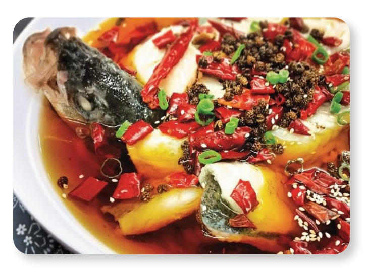
Super Spicy Hot Poached Seabass with Dried Chilli Oil 沸腾鲈鱼 £20.00