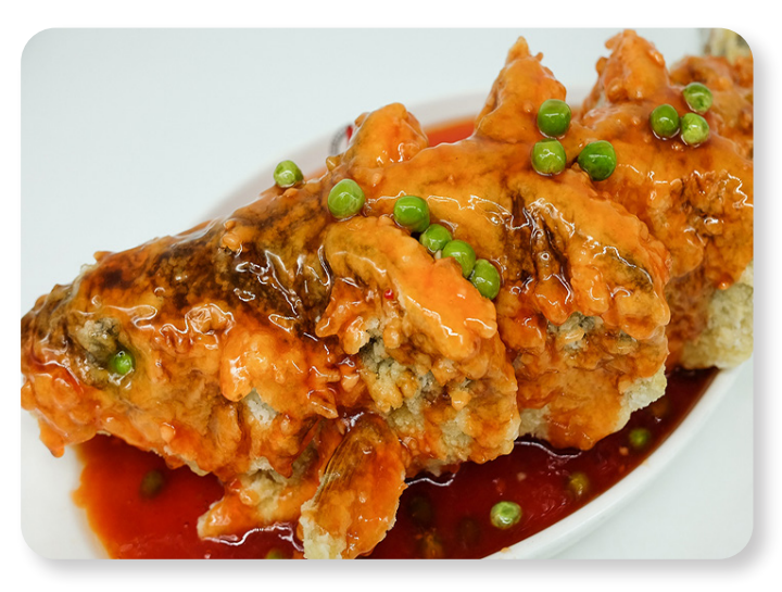
Crispy Whole Seabass with Sweet Vinegar 糖醋脆皮鱼 £19.00