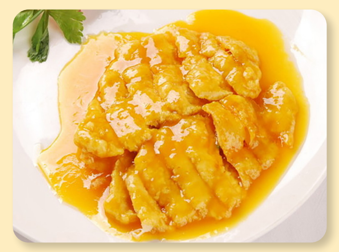
Deep Fried Chicken with Lemon Sauce 柠檬鸡 £11.50