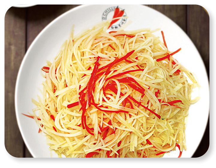
Sautéed Shredded Potato with Sliced Red Chilli 尖椒土豆丝 £11.50 v