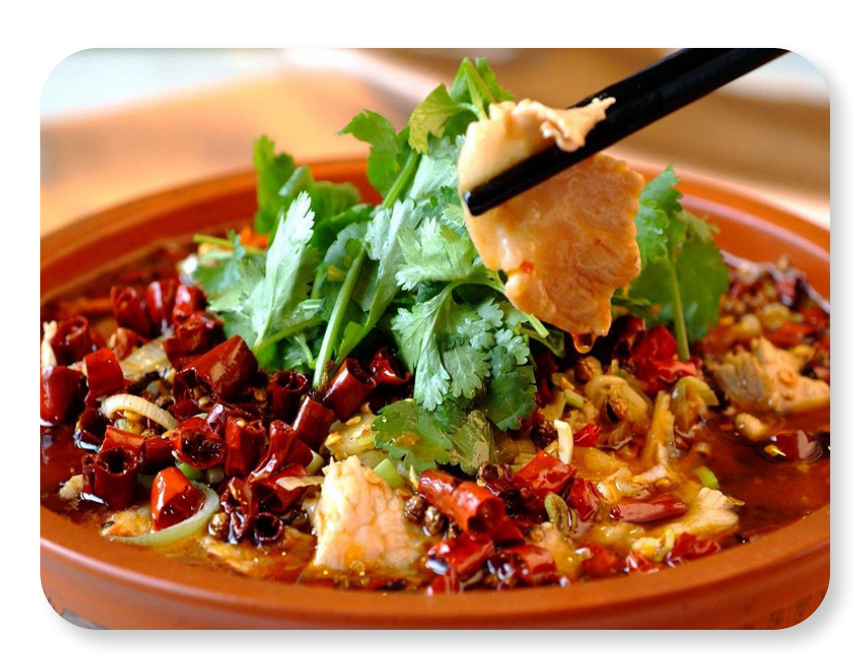
Spicy Hot Poached Sliced Pork in Chilli Oil 水煮猪肉片 £12.50