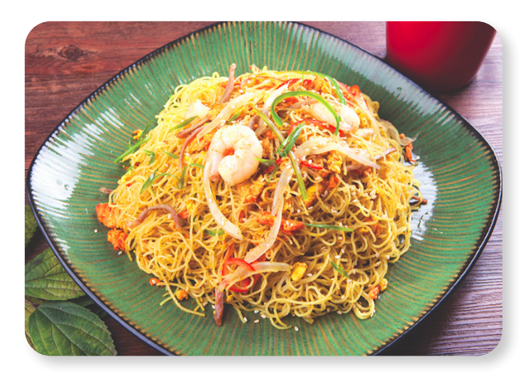
Singapore Vermicelli with Ham & Shrimp 星洲炒米粉 £10.50